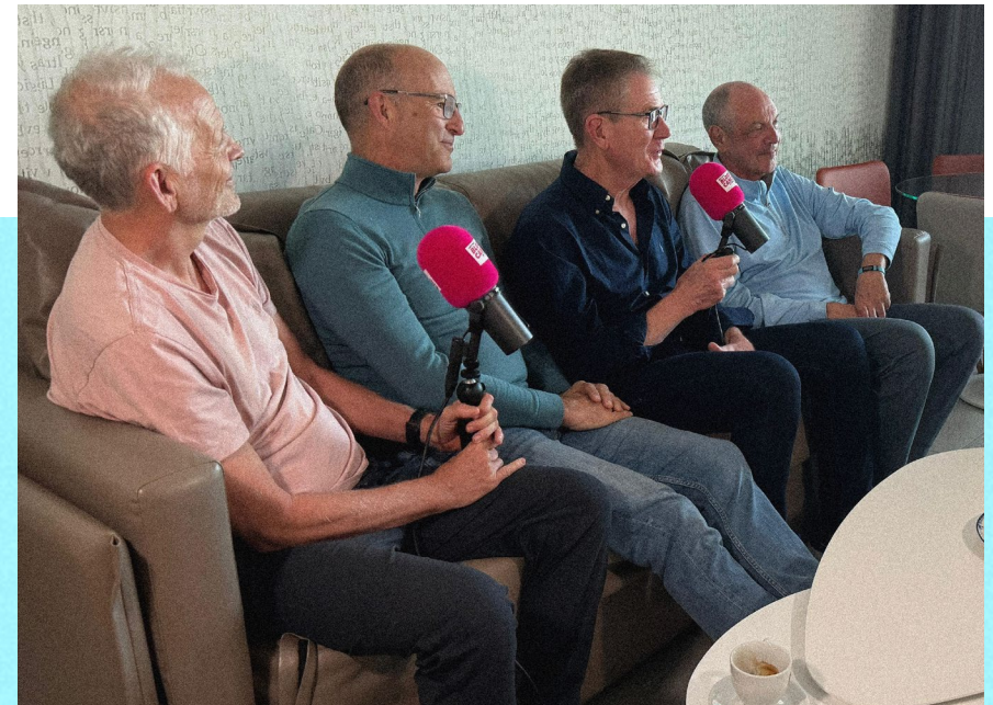
TAKING ON THE TOUR DE FRANCE WITH BLOOD CANCER