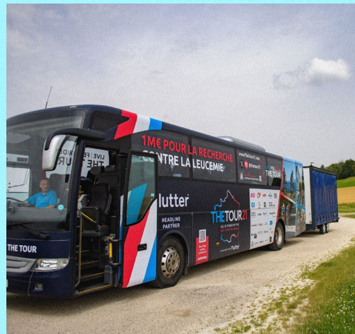
THE TOUR21 TEAM BUS & ADVANCE VEHICLE